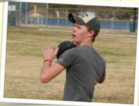
Flag football with a group of long time friends, most of them we knew from WACHE.